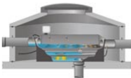
C-Class in operating mode

This is initiated by the IWM ® cleaning control system, which measures the volume flow in the inlet and outlet of the industrial inline-filter.