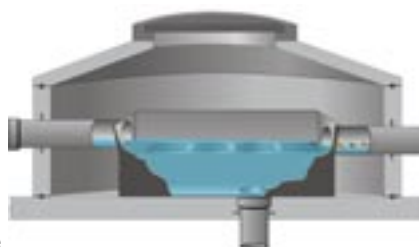
A-Class in cleaning mode

Optionally, the A-Class filter can be supplied with a specially developed spray lance in order to reduce the maintenance intervals. The customer shall provide the connection to the water supply for the additional equipment. The filter-cleaning operation can be activated manually or using pre-determined time cycles (magnetic valve and timer control) An additional building located water connection point ensures the supply for this auxiliary option.